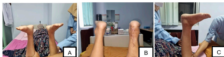
Figure 5. Follow-up condition (one month after the surgery). (A) anterior view, (B) posterior view, (C) lateral view. Note that plantarflexion can be noticed in both limbs (negative Matles test).