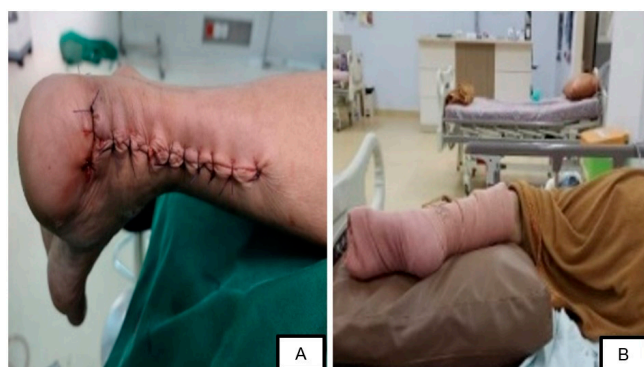
Figure 4. Postoperative clinical condition: (A) surgical wound closure, (B) fixation at 150° plantarflexion.

plantarflexion (Figure 4). There were no postoperative complications or signs of infection in the surgical wound, with mild pain reported by the patient (NRS: 1/10). The patient was advised to walk on crutches for 4–6 weeks while wearing slabs. Non-weight-bearing exercises were performed for one month and were then shifted to weight-bearing exercises the following month. After the one-week follow-up, the patient still had a limited active and passive range of motion (ROM). One month after the surgery, the patient reported minimal pain with limited (but improved) ROM (from grade 0 to grade 2) of her left ankle. She is still receiving physiotherapy on a regular basis to train the movement of her left ankle. An improvement was noted in the shape of the patient's left leg, which was no longer significantly different from her right leg (Figure 5). The patient consented to the publication of this case in the journal.