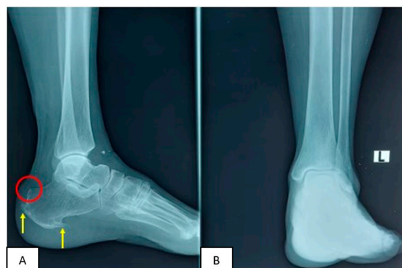
Figure 2. Preoperative X-ray of left ankle: (A) lateral view; (B) anteroposterior view. Note the observed prominent Haglund's deformity (red circle) with dorsal and plantar osteophyte formation on the calcaneus bone (arrow).

The patient was diagnosed with a chronic total rupture of the left Achilles tendon, which was hypothesized to be caused by the formation of Haglund's deformity. Surgery was conducted in a prone position. A skin incision was created at the medial rim of the Achilles tendon and then explored to the deep fascia until the Achilles tendon injury was viewable and the pointed edge of Haglund's deformity was revealed. The Haglund's deformity was resected, and the osteophyte was removed via surgical exostectomy. Tendon repair surgery was selected as the treatment modality using flexor hallucis longus (FHL) tendon transfer in conjunction with osteophyte removal. FHL tendon transfer was performed under general anesthesia. Briefly, the patient was situated in a prone position, followed by several stages: debridement (oriented to remove the fibrotic scar at the end of the tendon), identification (the exploration process to precisely identify the structure of the Achilles tendon and FHL), measurement of the FHL tendon, and harvesting (isolation of the FHL tendon). Finally, augmentation and fixation steps were performed to strengthen the Achilles tendon's bond and settle it alongside the FHL tendon. (Figure 3).