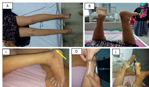
Figure 1. Preoperative clinical photo. (A,B) clinical picture of the patient's legs; (C) Haglund's deformity (arrow); (D) the measurement of the seven-centimeter gap between the insertion of the Achilles tendon and the calcaneus bone; (E) positive Thompson test.

The inspection of the left ankle revealed the presence of Haglund's deformity and a positive Matles test (the absence of plantar flexion). The deformity could be palpated as a bony prominence on the posterosuperior part of the calcaneus. No swelling, hematomas, or wounds were observed in the region (Figure 1). There was no pressure pain in the lateral part of the knee joint on palpation, but there was a gap formation, stretched about seven centimeters between the calcaneus bone and the Achilles tendon. The movement of her left ankle triggered pain (NRS: 3/10). Active movement to the dorsiflexion, eversion, and inversion positions could be performed adequately, but plantarflexion was not observed in the patient's left ankle. Passive movement yielded a normal range of motion (ROM). The Thompson test was positive on the left ankle. A plain ankle radiograph of the lateral projection of the patient's left ankle revealed the presence of osteophytes in the calcaneus bone and confirmed Haglund's deformity (Figure 2).