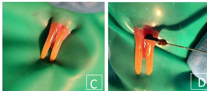
Gambar. C. Gingiva tikus wistar setelah pemasangan rubber sheet Gambar. D. Aplikasi pulp-out pada jaringan gingiva