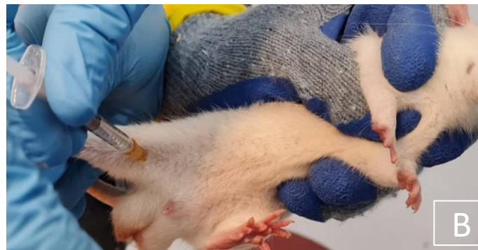
Gambar. B. Anastesi tikus wistar sebelum perlakuan