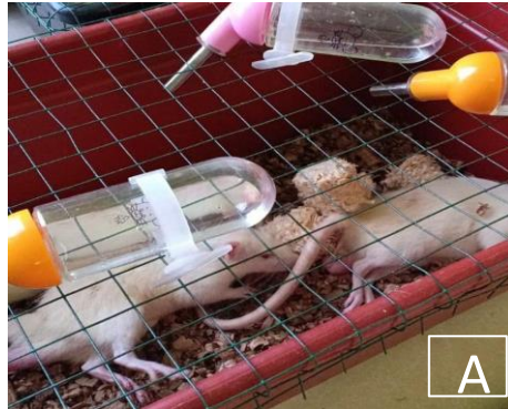
Gambar. A. Tempat adaptasi tikus wistar