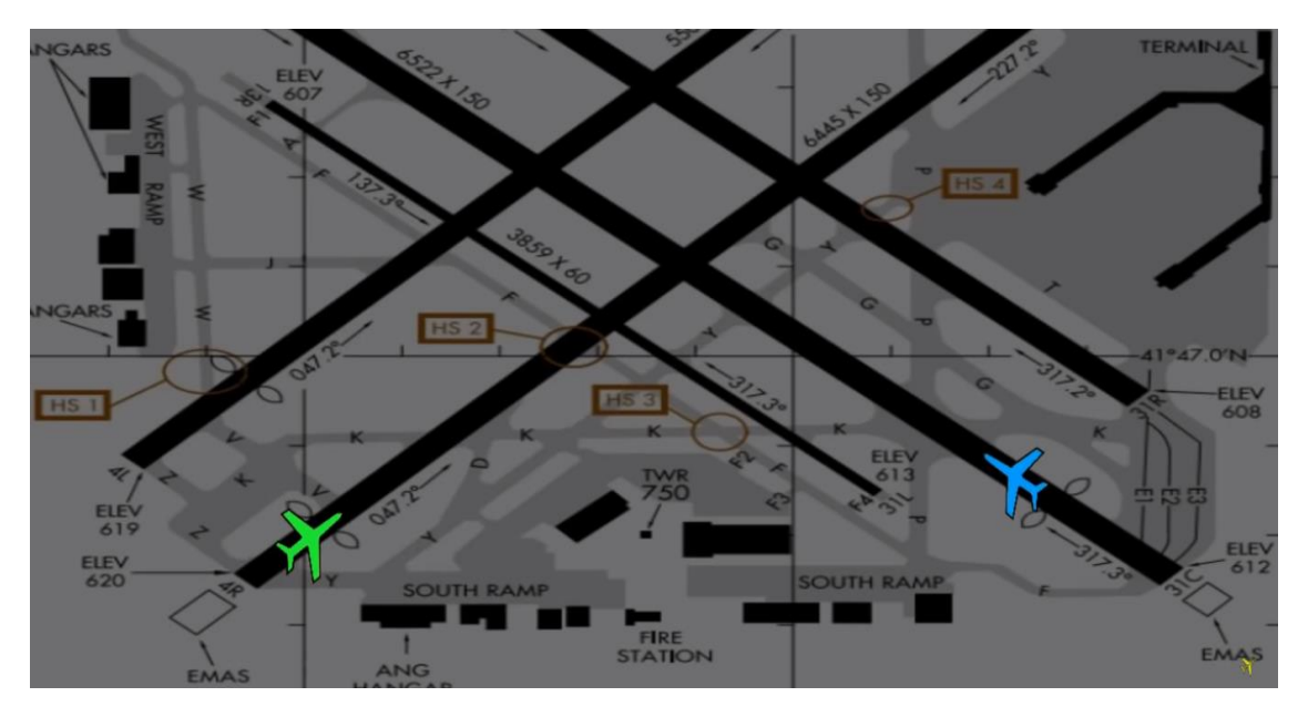
Figure 1. The Similar Callsign Caused Misunderstanding

miscommunication or misunderstanding caused by similar callsign