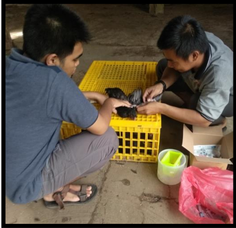
Pengambilan Sampel Darah