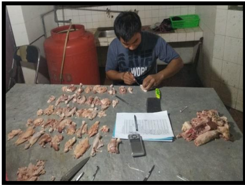
Koleksi Karkas dan Daging