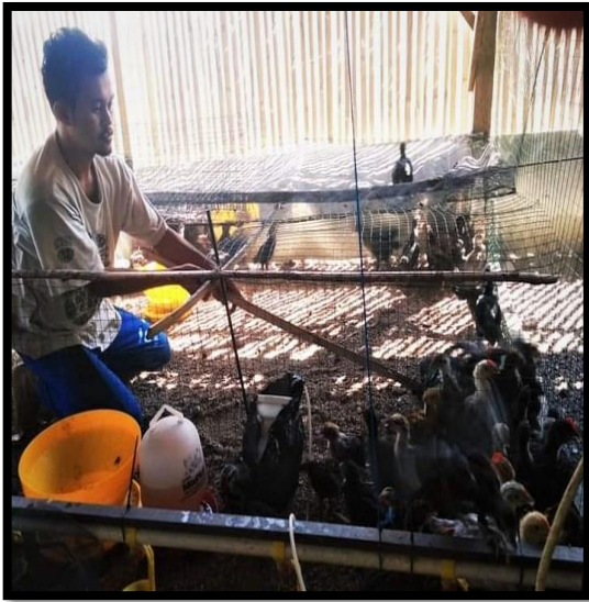
Pemeliharaan Fase Pembesaran