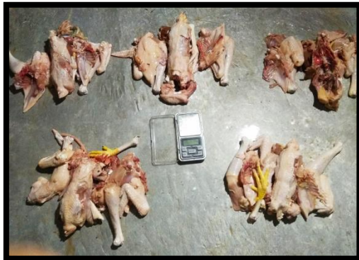
Komponen Karkas dan Daging