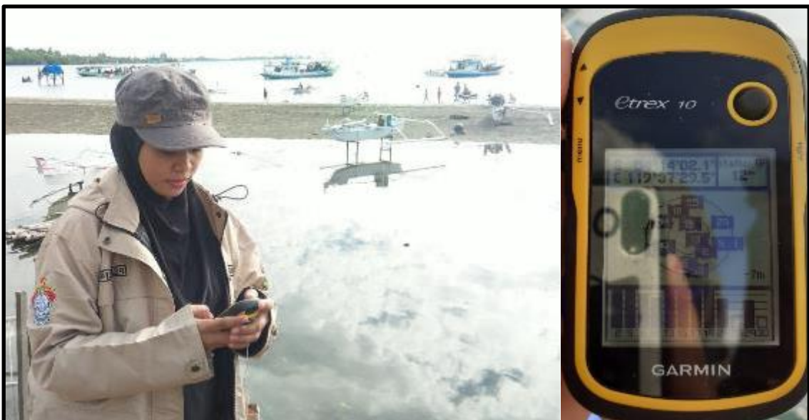
Penentuan fishing base di Desa Mtiro Ada'E Kecamatan Liukang Tupabbiring, Kabupaten Pangkajene dan Kepulauan, Provinsi Sulawesi Selatan