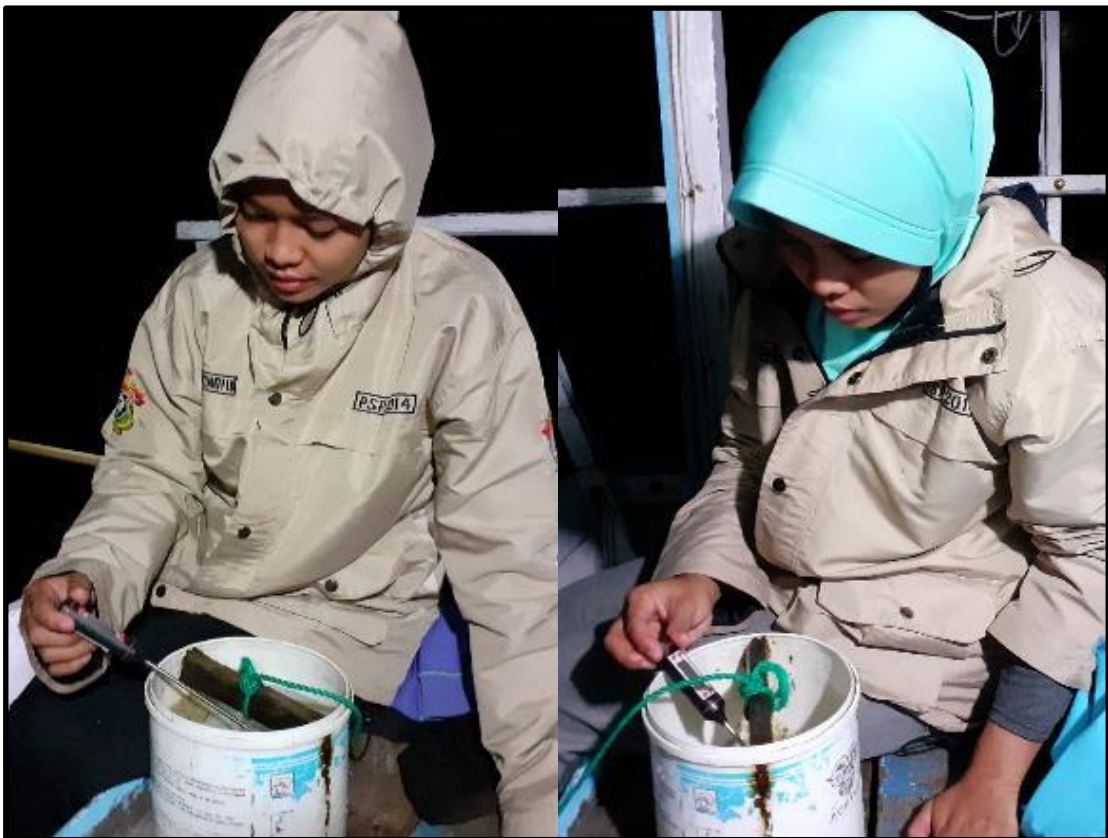
Pengukuran suhu permukaan laut yang beroperasi di perairan Barru, Selat Makassar