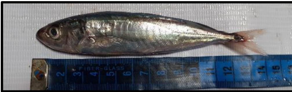
Hasil tangkapan ikan layang menggunakan pukat cincin beroperasi di perairan Barru, Selat Makassar