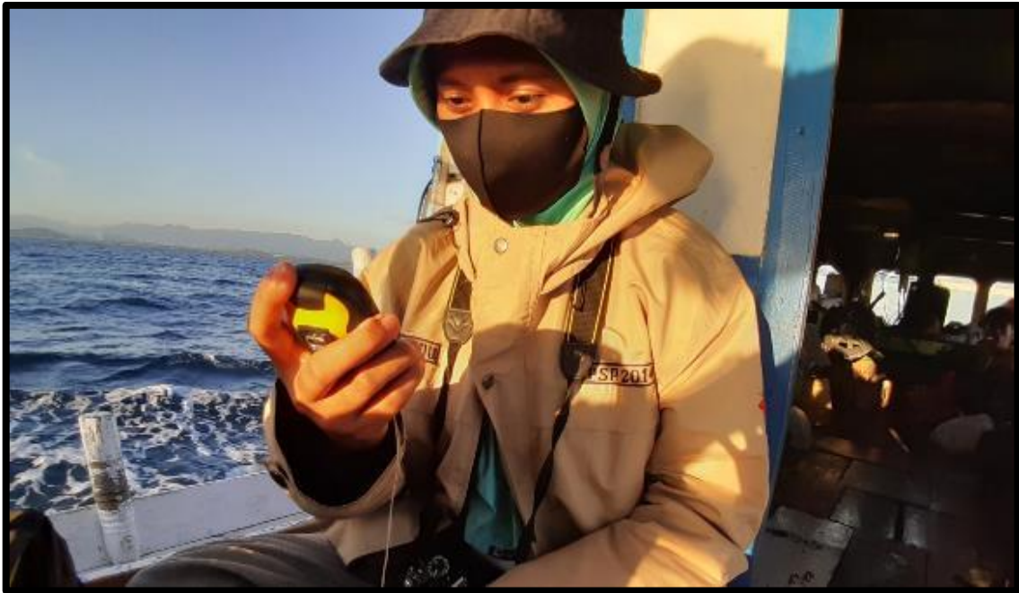
Lampiran 2. Penentuan fishing ground menggunakan GPS