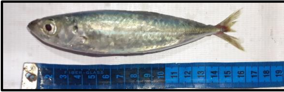
Hasil tangkapan ikan layang menggunakan pukat cincin yang beroperasi di perairan Pangkajene Kepulauan, Selat Makassar