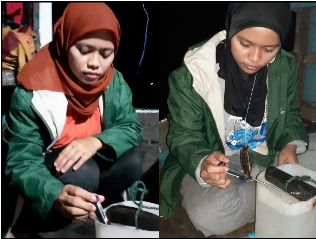
Pengukuran suhu permukaan laut yang beroperasi di perairan Pangkajene Kepulauan, Selat Makassar