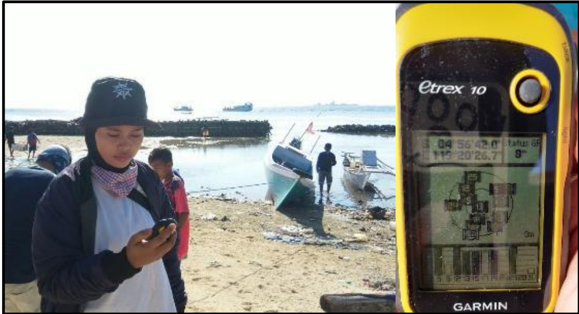
Penentuan fishing base di Desa Siddo, Kecamatan Soppeng Riaja, Kabupaten Barru, Provinsi Sulawesi Selatan