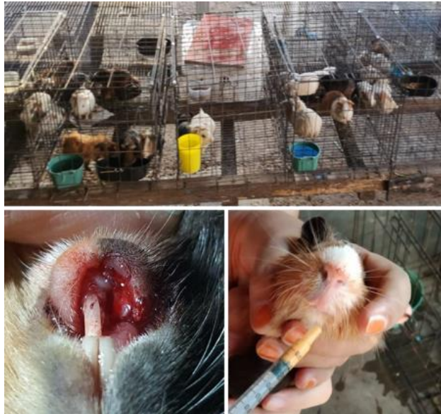
Gambar 13 Setelah marmut diadaptasikan selama 7 hari (20 Mei 2021), marmut dibagi menjadi 4 kelompok yaitu kelompok 1 (soket diisi dengan kitosan sisik ikan bandeng), kelompok 2 (soket gigi diisi xenograft/ kontrol positif), kelompok 3 (soket gigi diisi dengan kombinasi kitosan dan xenograft), dan kelompok 4 (soket gigi diisi dengan gel placebo/ kontrol negatif). Gigi insisivus kanan mandibula dicabut menggunakan needle holder. Soket diirigasi dengan larutan saline. Prosedur socket preservation dilakukan sesuai dengan kelompok perlakuan masing-masing (14 Juni 2021).