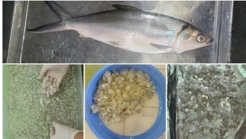
Gambar 9 Sisik bandeng diperoleh dari ikan bandeng ( Chanos-chanos ) yang berasal dari Kabupaten Pangkep, Sulawesi Selatan. Sisik ikan bandeng kemudian dibersihkan menggunakan air mengalir. Berat total sisik ikan yang diperoleh sebanyak 533 gram. (19 April 2021)