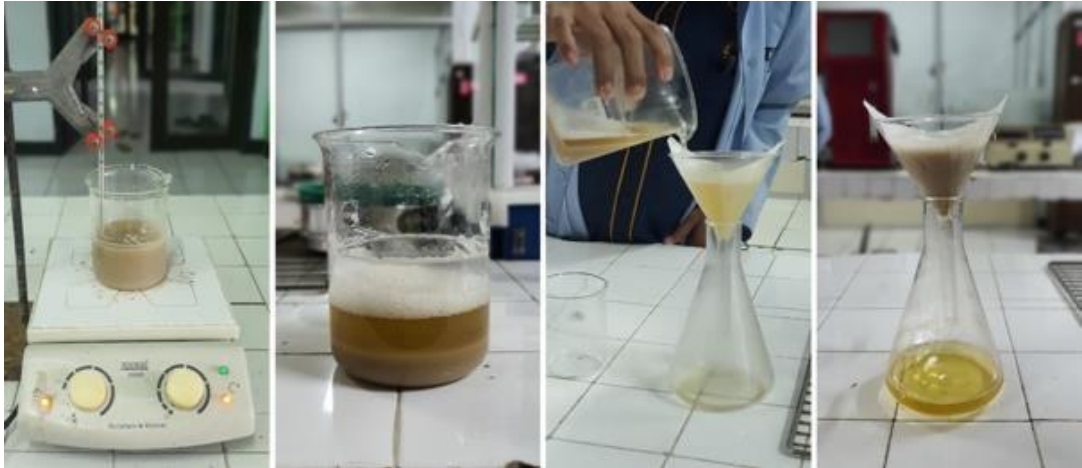
Gambar 11 Proses deproteinase dilakukan dengan pengadukan larutan NaOH 3,5 N pada suhu 90°C derajat selama 1 jam pada 50 rpm, kemudian disaring. Padatan yang diperoleh dibilas dengan akuades dan dikeringkan pada oven dengan suhu 70°C selama 24 jam (20 Mei 2021). Selanjutnya dilakukan demineralisasi untuk memperoleh kitin

dengan blender dan diayak. Diperoleh serbuk sisik ikan sebanyak 59 gram. (19 April 2021)