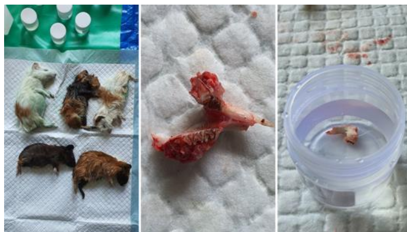
Gambar 14 Setelah pencabutan gigi insisivus rahang bawah dan diberi perlakuan, marmut dikorbankan pada hari ke 3 (18 Juni 2021), 7 (21 Juni 2021), 14 (28 Juni 2021), dan 28 (12 Juli 2021) untuk pengambilan jaringan pada rahang mandibula dan difiksasi menggunakan larutan buffer formalin 10% sebagai sampel penelitian