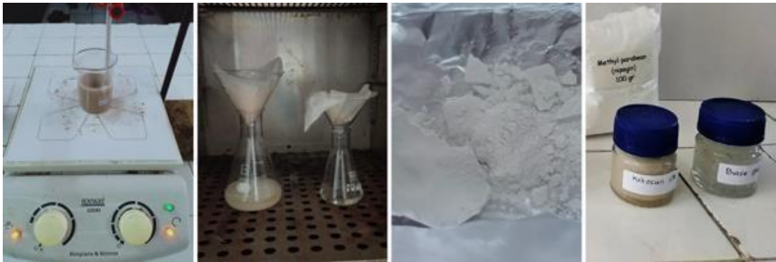
Gambar 12 Proses deasetilasi dilakukan dengan merendam kitin dalam larutan NaOH 40% dengan suhu 90°C selama 1,5 jam hingga diperoleh kitosan yang berwarna putih dan tidak berbau menyengat (22 Mei 2021). Uji derajat deasetilasi menunjukkan kitosan dengan derajat deasetilasi 96% (24 Mei 2021). Serbuk kitosan kemudian dicampurkan dengan gliserin, akuades, dan metil paraben untuk menghasilkan gel kitosan (7 Juni 2021)