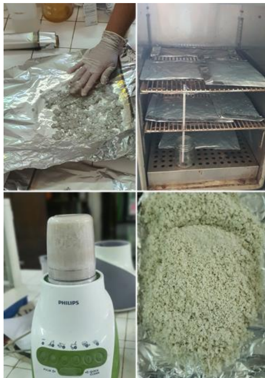
Gambar 10 Sisik ikan bandeng dibungkus dalam aluminium foil untuk pengeringan merata, dikeringkan dalam oven pada suhu 50-55°C selama tujuh hari, lalu dihaluskan