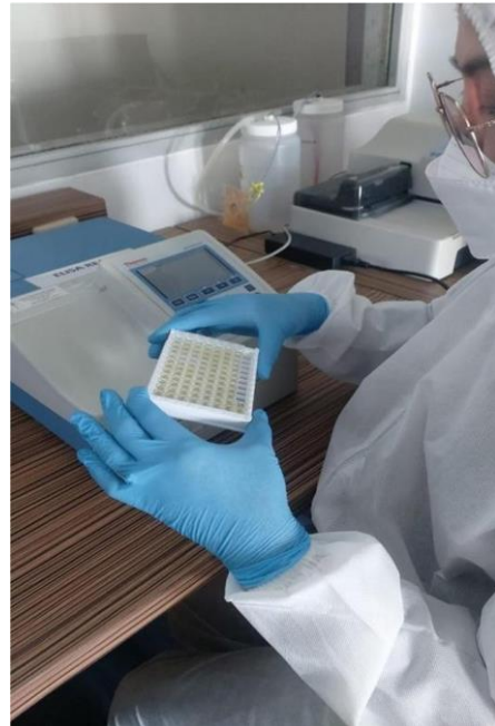
Gambar Pengukuran AQP3 dan CER menggunakan alat Elisa Reader