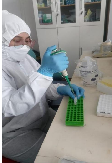
Gambar Preparasi Sampel Plasma Arteri umbilikal