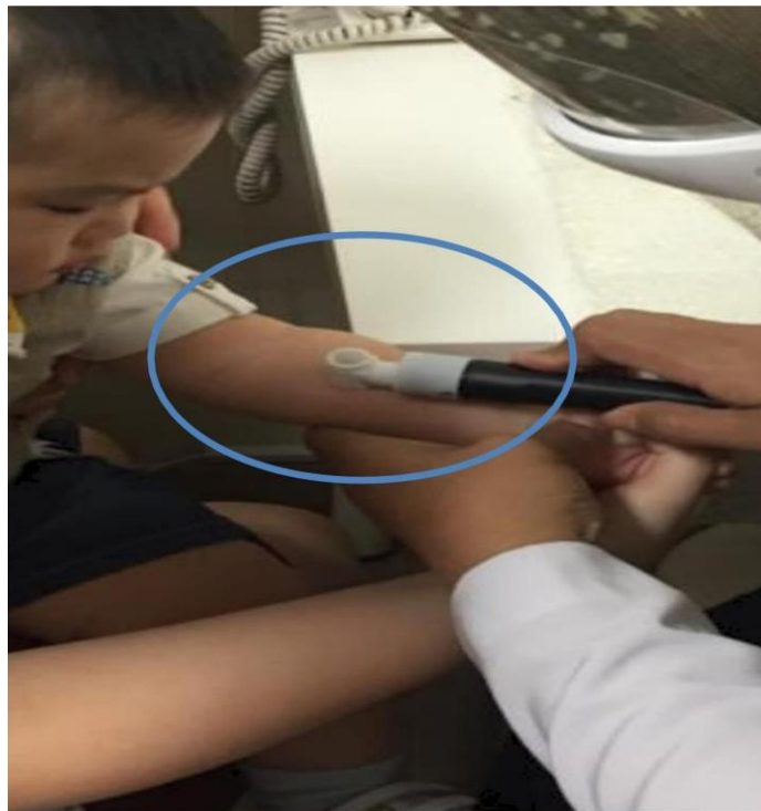
Gambar Pemeriksaan TEWL Bayi Umur 9-10 Bulan menggunakan alat Tewameter pada posisi lengan polar selama 30 detik