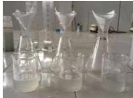
Proses filtrasi limbah cair laundry menggunakan kertas saring