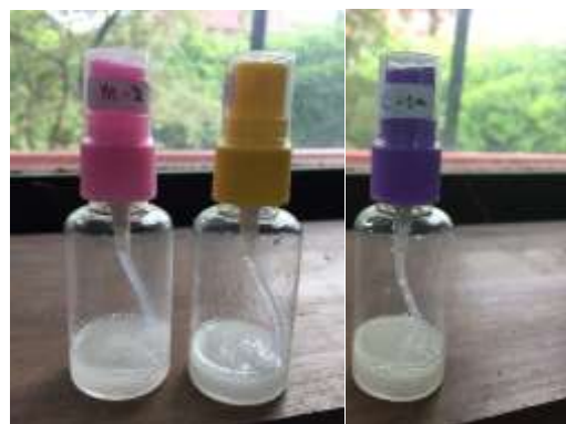
Produk Insektisida alternatif