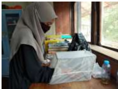
Pemberian pakan terhadap perkembangan nyamuk