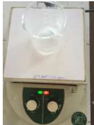
Proses pengadukan menggunakan plate dan magnetic stirre