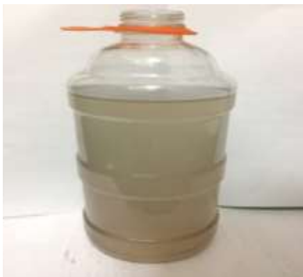
Limbah laundry sebelum filtrasi