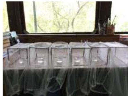
Proses kembangbiak nyamuk Aedes aegyty