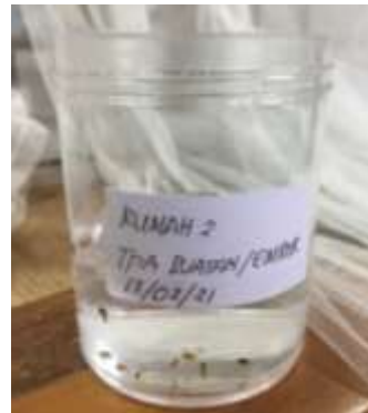
Larva nyamuk Aedes aegyty