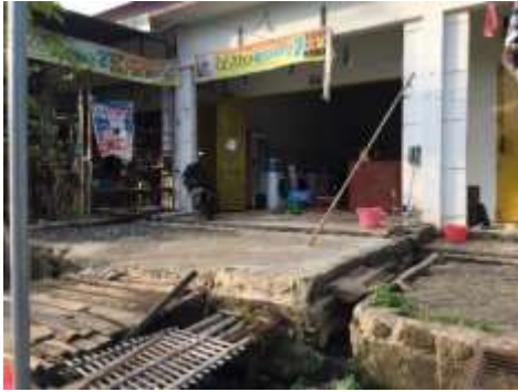
Jasa laundry yang langsung membuang limbahnya ke selokan terdekat