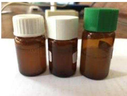
Insektisida alternatif sampel N 1 , N 2 sampel N 3