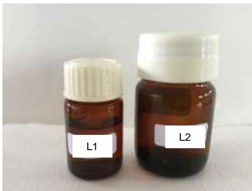
Insektisida alternatif Sampel L 1 dan sampel L 2