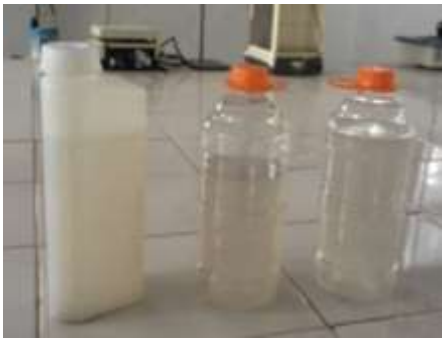
Proses pengendapan limbah cair laundry selama 24 jam