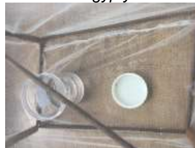
Larutan gula sebagai pakan nyamuk jantan Aedes aegyty