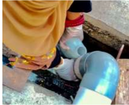
Pengambilan sampel limbah cair laundry