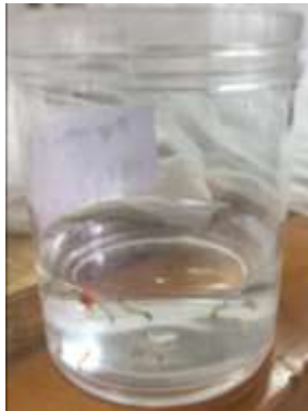
Jentik nyamuk Aedes aegyty