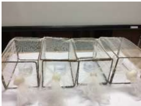
Kotak uji insektiisda alternatif