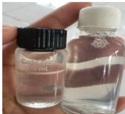
Limbah laundry setelah filtrasi