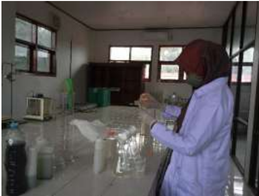
Proses pencampuran limbah laundri dan minyak atsiri