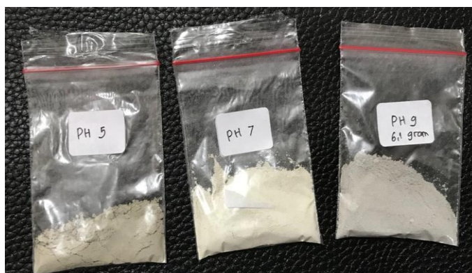
Gambar 3. Serbuk ZnO/kitosan