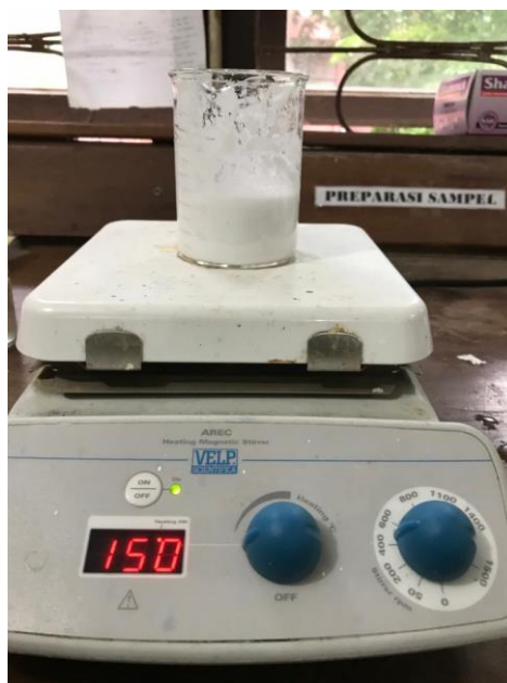
Gambar 2. Sintesis komposit ZnO/kitosan