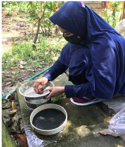
Lampiran 6. Pembersihan sampel akar