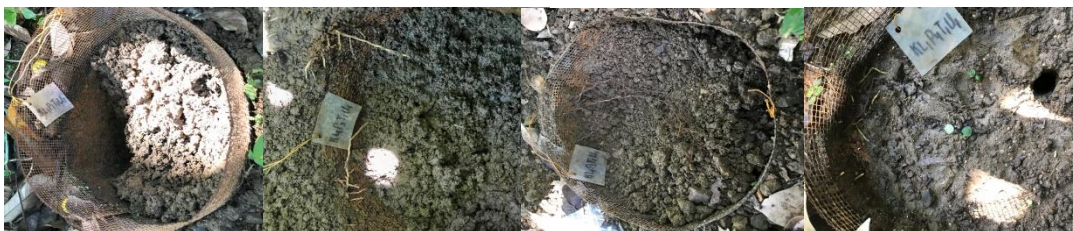
(tanpa pupuk) (354 g Urea) (500 g Phonska) (500 g Phonska + 194 g Urea)