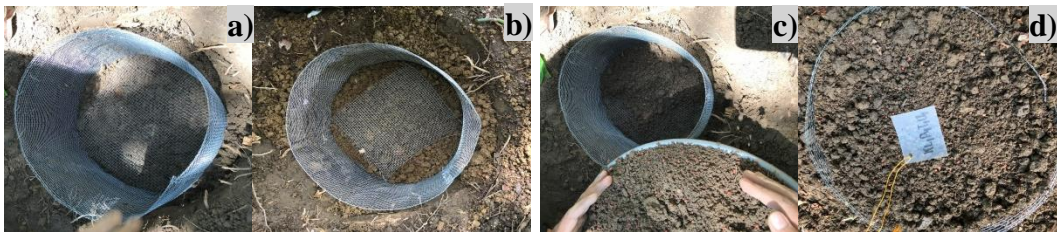
Lampiran 3. Pemasangan keranjang in-growth pada plot pengamatan