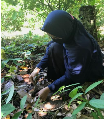
Lampiran 5. Pengambilan sampel akar setelah pemupukan pada pada in-growth media