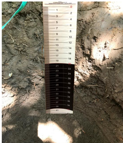
Lampiran 2. Galian lubang plot pengamatan diameter 30 cm dan tinggi 40 cm dengan menggunakan bor tanah spesifik yang dibuat