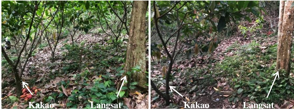
Lampiran 1. Posisi plot pengamatan pada penggunaan lahan kakao-langsar