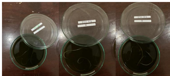
(Replikasi 2 EDJ 10%, 15%, dan 20%)