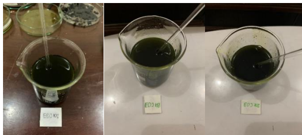
(Larutan ekstrak daun jarak pagar)