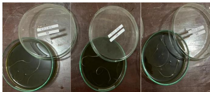
(Replikasi 3 EDJ 10%, 15%, dan 20%)