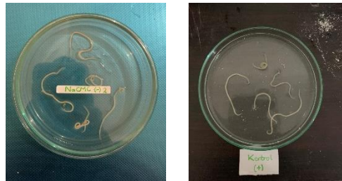
(Kontrol negative dan Kontrol positif)