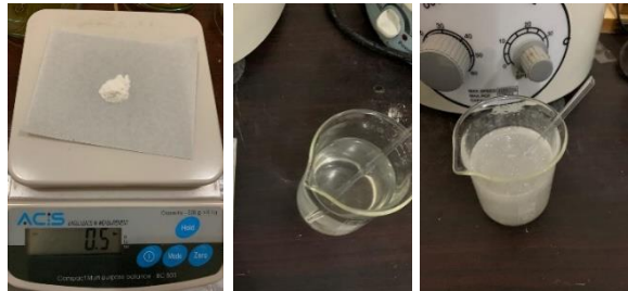
(Membuat larutan NaCMC 0,5%)