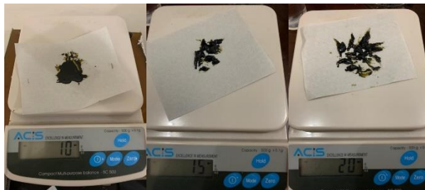
(Menimbang ekstrak daun jarak pagar berdasarkan variasi konsentrasi)