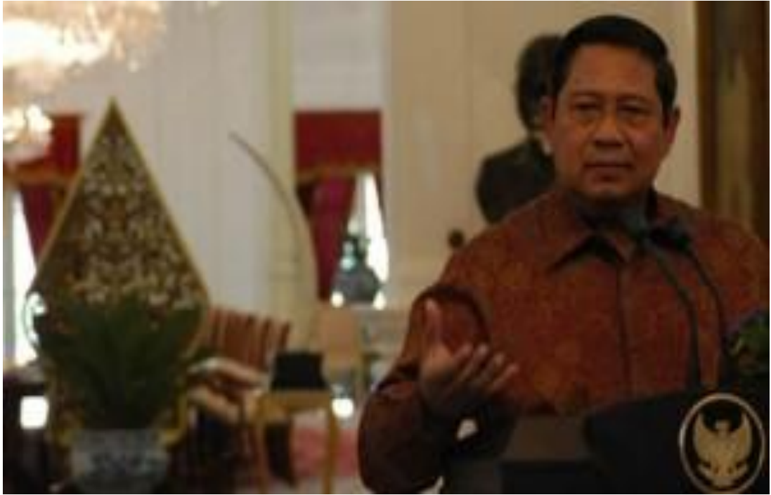
pak beye DENGAN tahlalat di dahi kanan yang menjadi ciri khasnya, 2006