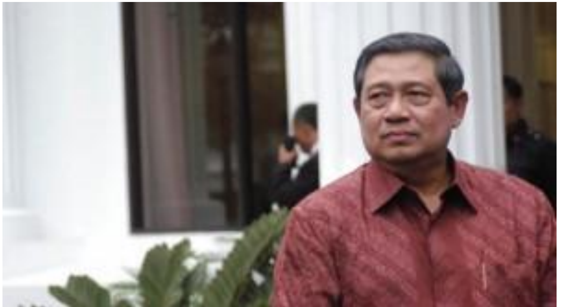
pak beye TANPA tahlalat di dahi kanan yang menjadi ciri khasnya, 2008