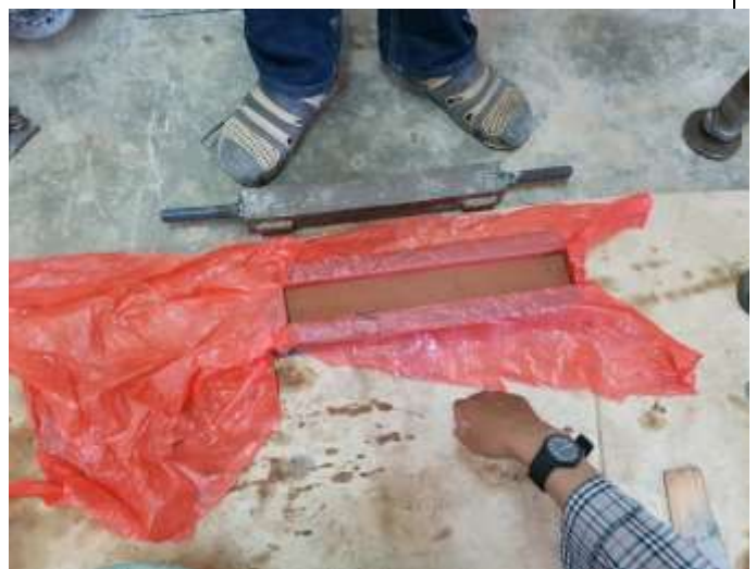
Sampel yang sudah di Padatkan