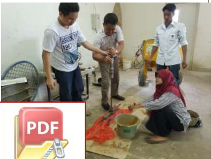
Sampel dengan cara di Tumbuk