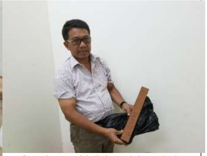
Sampel yang sudah di simpan beberapa hari