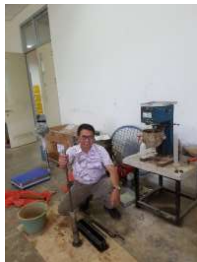
Alat Untuk Mencetak Sampel