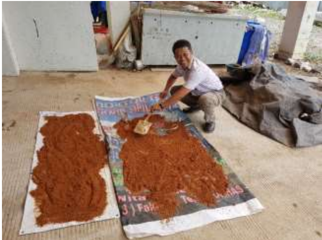
Bahan Tanah yang di Keringkan