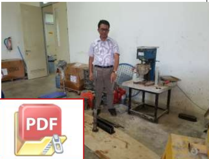
Alat Untuk Mencetak Sampel