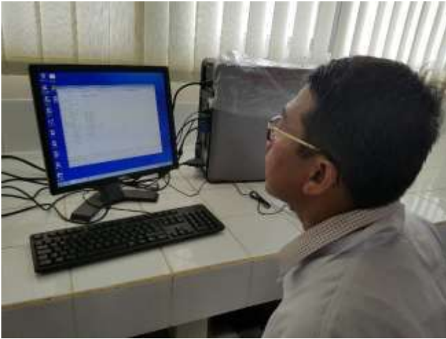
Komputer sebagai output