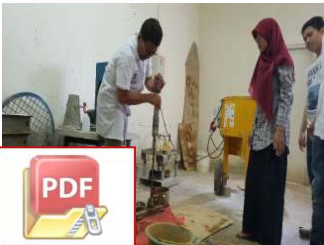
Proses Pembuatan Sampel