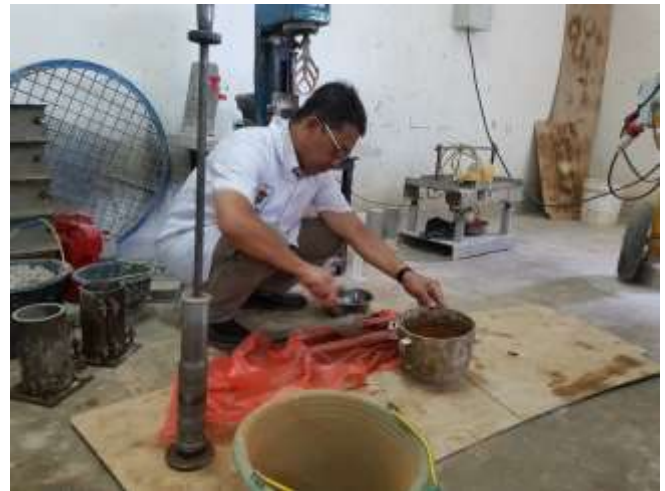
Proses Pembuatan Sampel