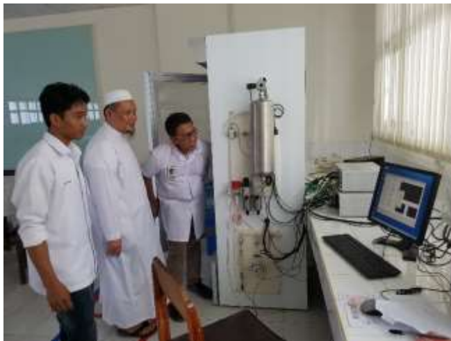
Mengecek Hasil Pembacaan Sampel