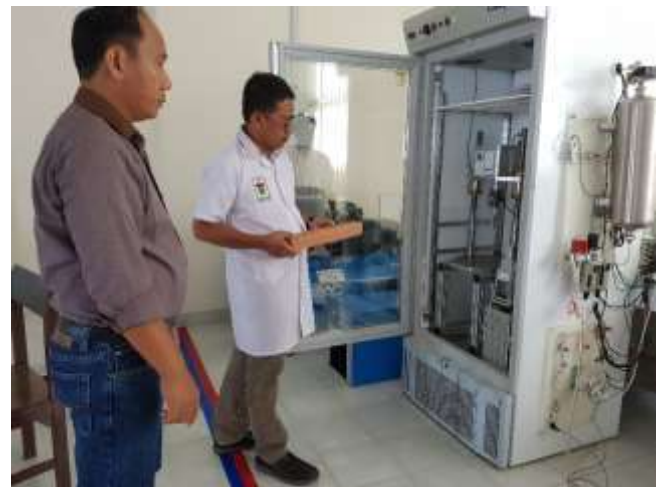
Menyiapkan Sampel Untuk di Uji