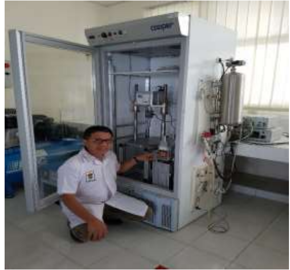
Sampel Siap di Uji