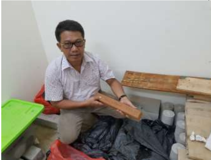
Sampel yang sudah di simpan beberapa hari