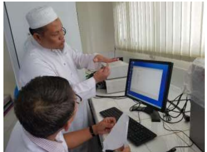
Penjelasan dari Pembimbing