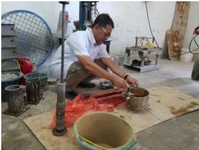
Proses Pembuatan Sampel